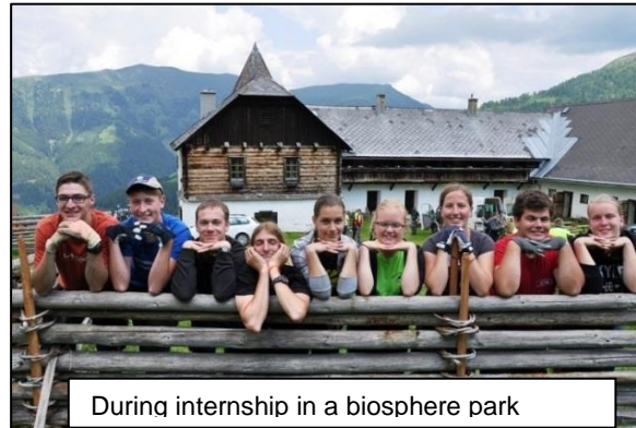
During internship in a biosphere park

BC Naklo-High school also provides educational programmes in other professional fields: