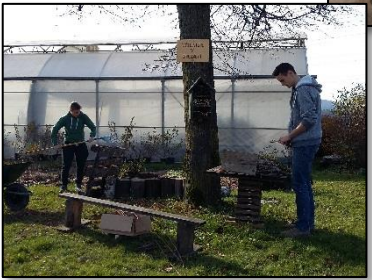
Working in an outdoor classroom.