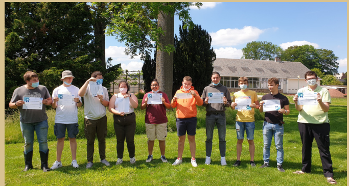
ITH Students receiving the mobility certificate

After seeing the involvement of the students in the work, in the exchanges and then their happiness at the end of the meeting, we can say that this seminar, even being virtual, was really a great success.